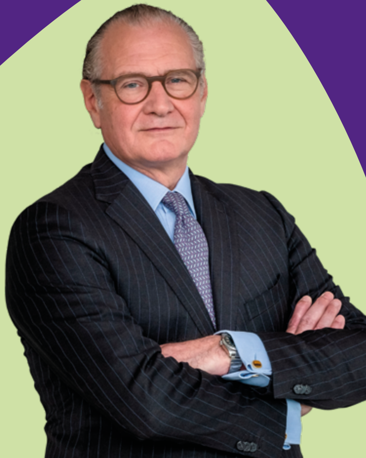
Stefan Oschmann, Chairman of the Executive Board and CEO

"We are curious minds dedicated to human progress. I firmly believe that this is a day and age in which we can find answers to many of the challenges facing the global community if we enable diverse teams to share and leverage the best ideas. As a company with curious, open-minded employees, we take our responsibility very seriously and want to help shape the rapid technological change so that as many people as possible benefit from it."